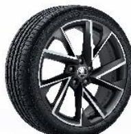
19" 'VEGA' Alloys

ŠKODA reserves the right to make changes to specifications, colours and prices without notice. Whilst we make every effort to ensure that specifications are accurate at the time of publication, you should always check with your ŠKODA dealer for the latest information.