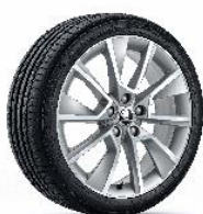
18" 'BRAGA' Alloys