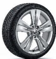
18" 'MYTIKAS' Alloys