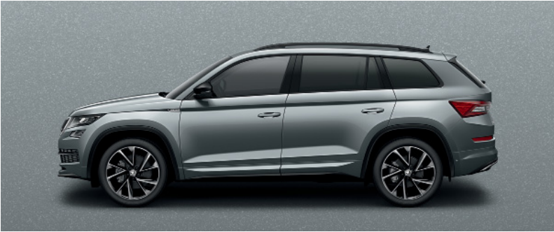
BUSINESS GREY METALLIC