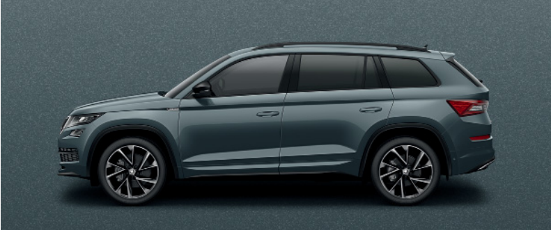
QUARTZ GREY METALLIC