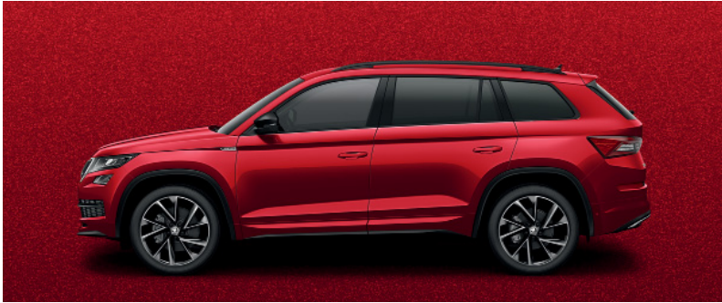
VELVET RED METALLIC