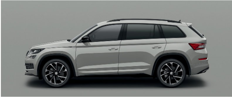
STEEL GREY UNI